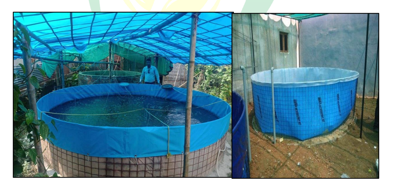
Fig. 1. Representative Biofloc Tanks

Earth work excavation and construction of bund, Polyethylene lining, Inlet, outlet, and central drainage system, PVC pipe fittings for air, water flow, Pump house-100sqf, Pumps-1 nos. 3 HP, Aerator-4 nos., Air Blower, Aeration tubes, Generator set 10 KVA, Net, Imhoff cone, weighing balance, water testing kits and other accessories, Bio security Measure-Bird net, crab net, Electrification L.S., Watchman shed-10sqf etc. (Fig 1).